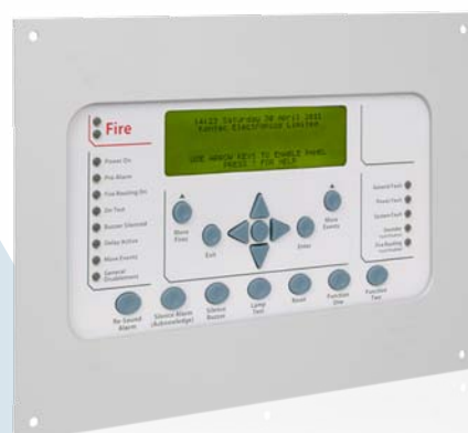
Model No. MK67000AM1