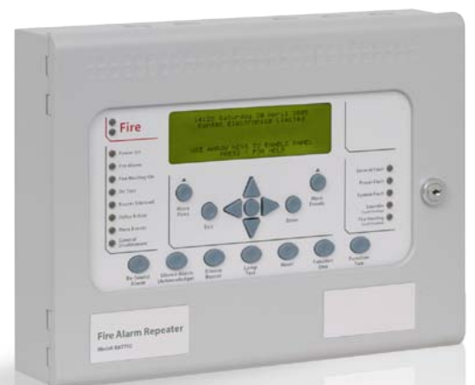
Model No. MK67750M1